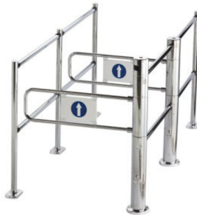
OVERGATE WITH RADAR Motorised swing gate with sensors for opening detection