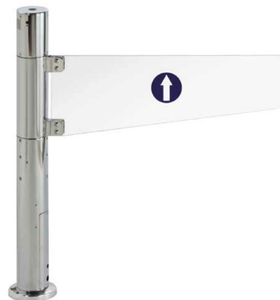
OVERGATE PANEL Fast and safe swing gate equipped with detection algorithms