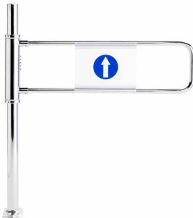
MECHANICAL GATE Robust, single arm mechanical swing gate