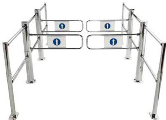
OVERGATE WITH PHOTOCELLS Motorised swing gate with detection sensors and visual LED cues