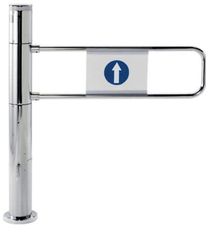
OVERGATE WITH TUBULAR ARM Robust, single arm motorised swing gate

In the event of a power failure, the arm is free to move. When power returns, if the arm has been moved from its closed position, it will automatically return to closed position.