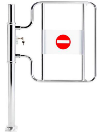
CHECKOUT EXIT GATE Robust, single arm mechanical swing gate, acting as a theft deterrent